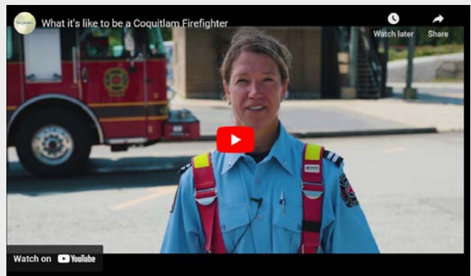
Watch: What it's like to be a Coquitlam Firefighter