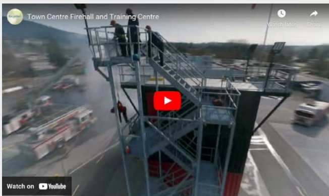
Watch: Town Centre Firehall and Training Centre

We welcome candidates from various backgrounds to bring their unique strengths, experiences and resiliency to the Fire service. Our diversity makes us stronger and enhances our ability to serve the community.