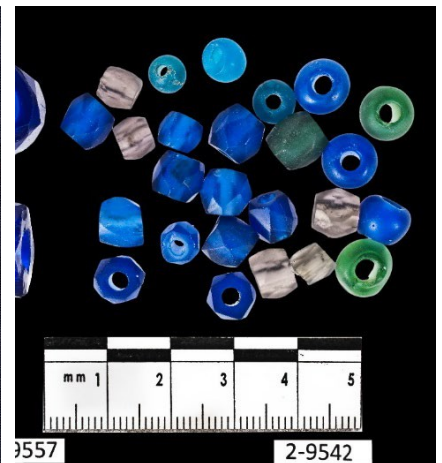
Photo Credit (middle): https://www.canadashistory.ca/explore/fur-trade/tobacco-pipes . Photo Credit: Oregon Museum of Natural and Cultural History, Glass trade beads ( https://mnch.uoregon.edu/index.php/collections-galleries ).