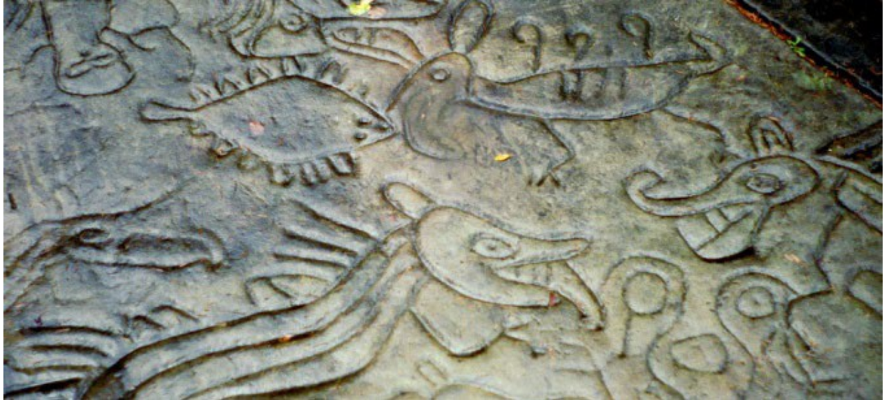
Portion of petroglyph panel at Petroglyph Provincial Park, Nanaimo.

Northwest Coast rock art includes images depicted on boulders, rock overhangs, rock faces, or other exposed rock surfaces. Pictographs are drawings or designs painted on rock using pigments like ochre or charcoal mixed with grease. Petroglyphs are images incised or pecked into stone. Designs vary widely and often depict animals, humans, or an extensive variety of geometric shapes.