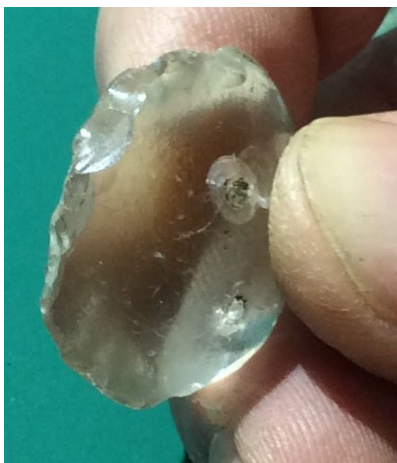
Worked glass and clay stone pipe, Coquitlam.

Indigenous use of European materials in the years following contact are often found in early historic sites. Ceramics, glass, and metal were valued for their strength, durability, ease of access, or aesthetic properties. Glass was worked using traditional stone tool techniques in the same way as obsidian (a natural volcanic glass). Clay pipes were adopted by Indigenous peoples who several centuries earlier had introduced the practice of tobacco smoking to European traders. Glass beads were used by European fur traders to trade with Indigenous peoples; trade beads were initially valued for their vibrant colour and the expectation of beads as a wealth item.