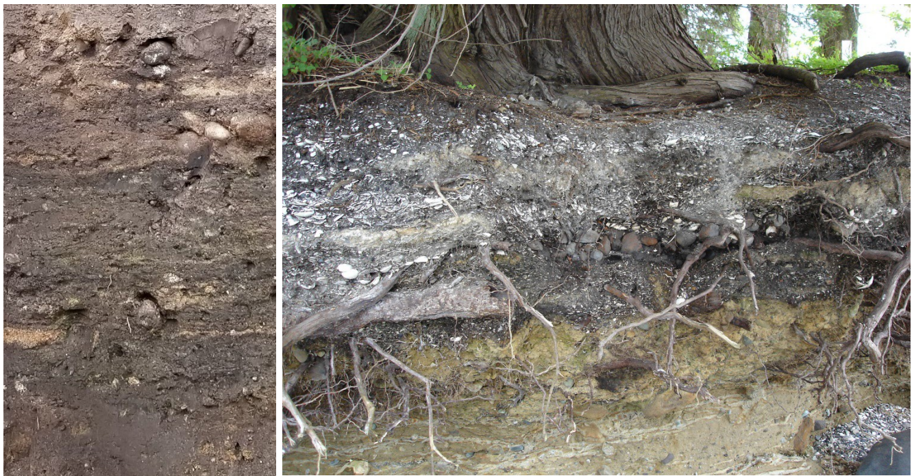
Photo Credit (left): B&OA, Non-shell stratified midden Port Coquitlam. Photo Credit (right): Shell midden, Vancouver Island ( https://learning.royalbcmuseum.bc.ca/pathways/can- )

In Coquitlam, non-shell middens are the more common site type but there are a few examples of inland shell midden sites associated with camps or settlements where shellfish was transported to locations by travel or trade.