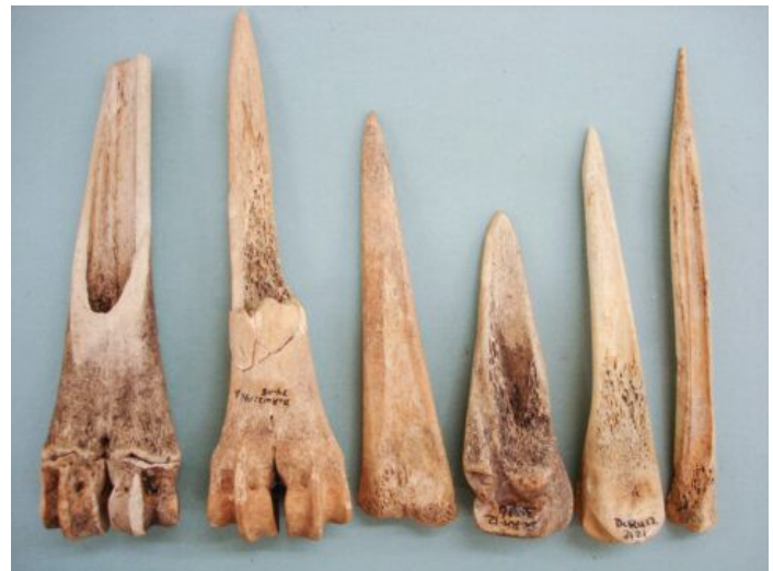
Photo Credit: RBCM, Archaeology Collection. Antler and wood tools ( https://learning.royalbcmuseum.bc.ca )

Stone tools common to this region include projectile points, knives, adzes (axes), scrapers, mauls (hammers), net weights, beads, and more. Archaeologists distinguish chipped stone from ground stone artifacts, each distinguished by the mode of manufacture, either flaking scars or grinding and polishing marks. Stone flakes or 'debitage' is produced during the process of making stone tools. These flakes were sometimes used as tools themselves or were left behind at the stone tool working site. Culturally produced debitage shows features distinctive from naturally broken rock, gravel or crush, but these signatures can be difficult to identify to an untrained eye. Stone artifacts were produced from dacite, quartzite, slate and nephrite as well as obsidian, chert, and other materials. Stone was acquired locally or transported or traded over long distances; high-quality materials like obsidian has been traced to locations from Prince Rupert to Oregon and beyond.