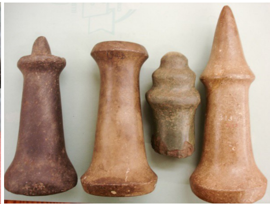
Photo Credit (left): B&OA, Nephrite ground stone adze from Port Coquitlam. Photo Credit (right): RBCM, Archaeology Collection. Ground stone hand mauls ( https://learning.royalbcmuseum.bc.ca )