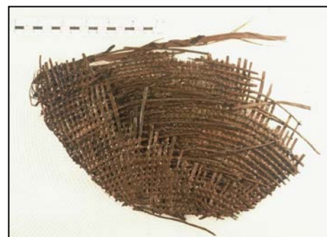
Ground slate knife with wooden handle, Agassiz. Waterlogged and preserved basket, Coquitlam.