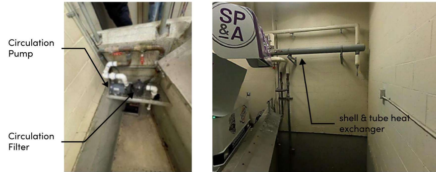
Figure 42 - Existing Snow Melt Pit Configuration 10