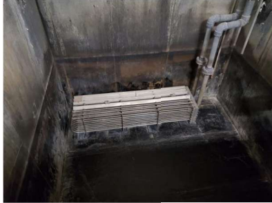
Figure 43 - Example of Proposed Heat Exchanger Retrofit 11