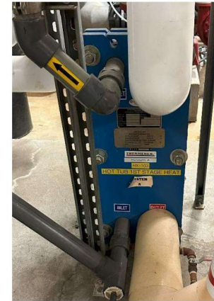
Figure 64 - Existing Pool Heat Exchangers and Their Capacities (top), HX-103 (bottom)