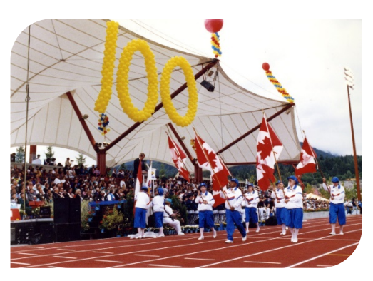
9 . B.C. Summer Games Opening Ceremonies, 1991

Despite discrimination, members of immigrant and marginalized groups managed to establish themselves in the community. The Chinese community created market gardens, restaurants and shops. The Sikh community built a gurdwara at Fraser Mills, with lumber provided by the company. And the Francophone community and culture continues to thrive.