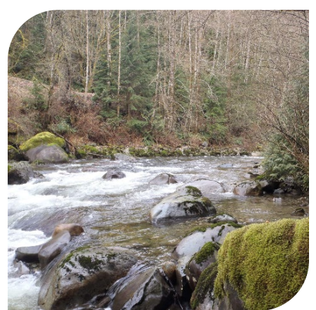
2. Coquitlam River

traditional lands, particularly for decimating the sockeye salmon run which gave the city its name and remains a key issue for Kwikwetlem today. Coquitlam river flooding over the last century necessitated dyking projects beginning in the 1990s.