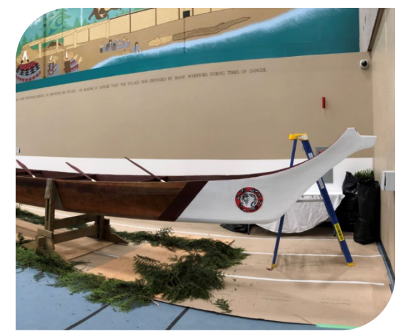
11 . Kwikwetlem First Nation canoe at Healing Spirit House

The city's position with easy access to the Fraser River made it a choice location to settle and develop settler economies. The first shipments of lumber from Fraser Mills were by ship from the company's docks on the river.