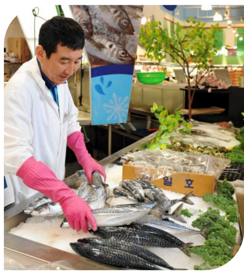
6 . Seafood store in Burquitlam's Korean neighbourhood

sector giving way to the residential areas of Austin Heights with high and flat plateau topography. In between, residential neighbourhoods associated with different settler groups have evolved into places with modest houses and individual character. The city and its people have evolved and changed over the course of its history, and is today one of the fastest growing cities in the province.