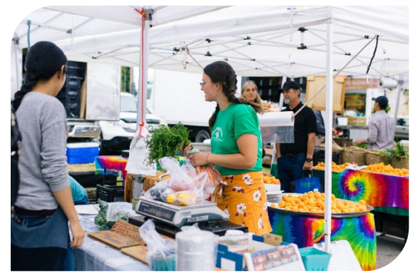
8. Poirier Street Farmers Market

The Canadian Western Lumber Company, known as Fraser Mills,