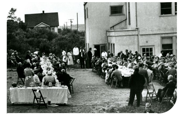
13. Gathering outside Our Lady Fatima Parish

Coquitlam's geographical situation with its southern boundary next to the Fraser River and its northern boundary within Coast Mountains has created an urban and human geography that