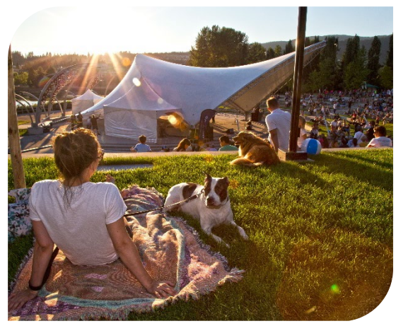
14. Coquitlam Summer Concert Series

Coquitlam's identity is defined in part through its arts and culture context. This is found in community arts organizations and places such as the Place des Arts and the Evergreen Cultural Centre, public art and the city's many individual artists. Hosted by the Kwikwetlem First Nation, a historic canoe dedication ceremony took place on the Riverview Lands at həy'\xwət kw0ə šxwhəli? leləm or Healing Spirit House. Understanding the importance of filmmaking is part of Coquitlam's character, from an economic perspective and for revealing how the city is portrayed and understood in film, and the City has recently completed planning for a new South West Arts & Heritage Centre as a priority. While there are others, these examples illustrate the diversity of Coquitlam's arts and culture scene, and its contribution to city livability and character.