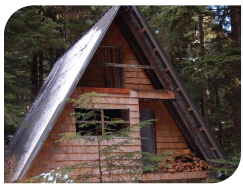
10. Cabin in the Burke Mountain ski village

Sports and recreation represent the convergence of nature and community. The Westwood Racing Circuit opened on the Westwood Plateau in 1959, an area that at that time was far removed from the region's population centres, and was operational until 1990. In the late 1960s, Burke Mountain Ski Resorts offered transportation up the east Coquitlam mountain, a lodge and rope tows for two seasons. More than 100 families held leases on the mountain, building their own ski cabins. Today, the mountain slopes are home to extensive mountain biking trails.