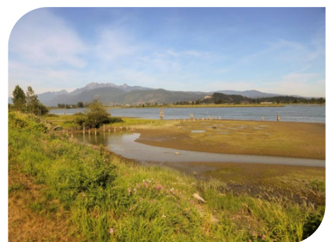
1. DeBoville Slough

Coquitlam's geography has influenced its settler history, sometimes with significant impacts. Dam construction to provide the city's water has been devastating through its impact on natural waterways and Kwikwetlem