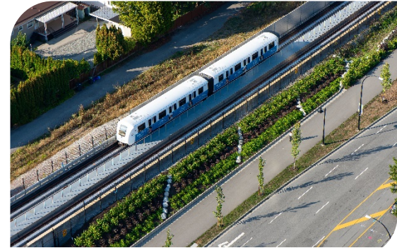
12. Skytrain on Clarke Rd.

As part of the burgeoning city centre, the long-awaited Evergreen Extension of the Millennium SkyTrain Line opened in 2016, running from Lougheed Town Centre in Burnaby to Lafarge Lake– Douglas in Coquitlam. The city has four SkyTrain stations on the Millennium Line that are a part of the extension. Another modern and sustainable transportation mode, the West Coast Express, was an important addition to the city's commuter culture in 1995.