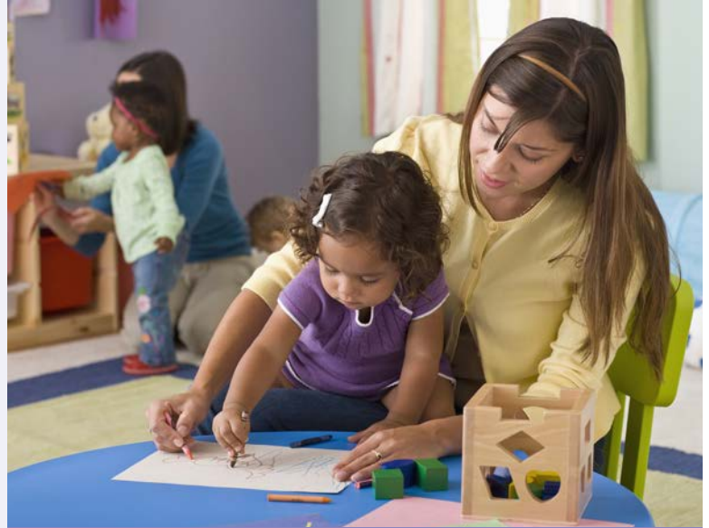
Child care facilities are not permitted in buildings containing unauthorized or non-compliant secondary suites.

Child care facilities with over eight children operated within a dwelling unit are not considered part of the residential use and are subject to all the requirements stated below.