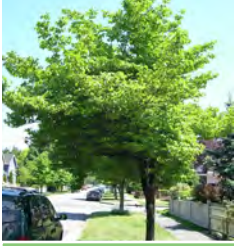
Western Flowering Dogwood