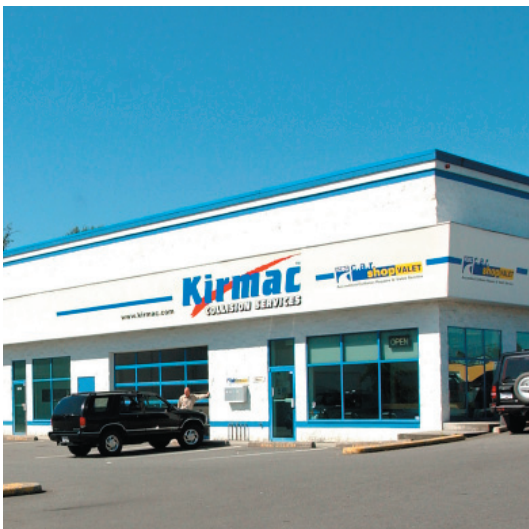
Kirmac Collision Services

The Barnet Corridor is conveniently located between the northern and southern portions of Coquitlam and abuts the Town Centre. It is home to a variety of commercial and retail services, including medical, dental, banking and insurance services, as well as restaurants. Industrial land in this area can be found south of Barnet Highway. Businesses related to the home and automobile are also conveniently located in this area.