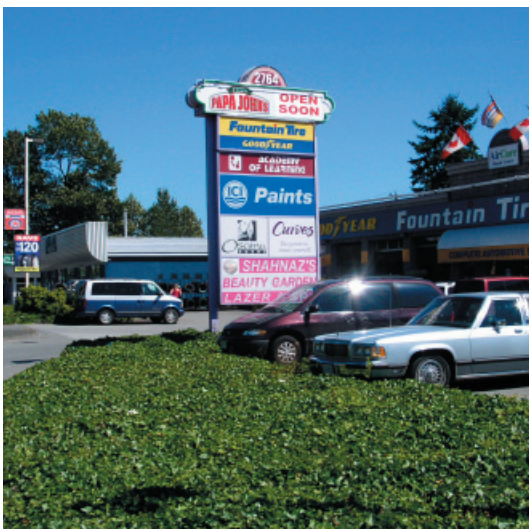
Commercial on Barnet Highway