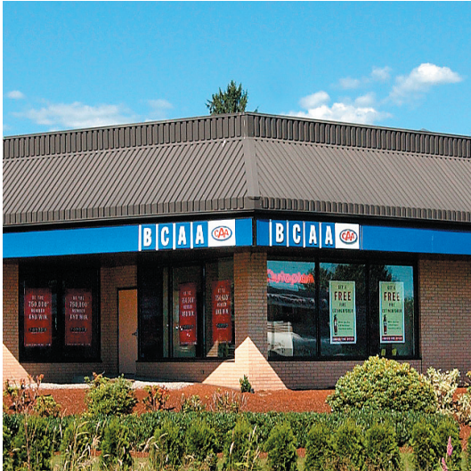
BC Automobile Association